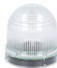
Signal beacons Ø62mm/2.44" 8LB6EL