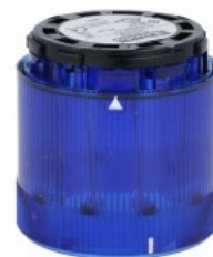
Signal tower Ø70mm/2.75" 8LT7EL - Light modules