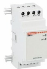
Expansion modules for modular products - communication port EXM1011