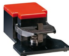
One pedal, with safety lever - open KG110