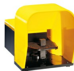
One pedal, with two-stage safety lever - with cover KG211