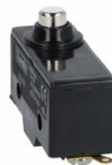
Top push rod - metal and low rod plunger KSA3