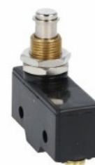
Top push rod - metal plunger. M12 fixing head KSA4