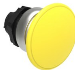
Mushroom head pushbutton, spring return Ø 40mm/1.6" LPCB614