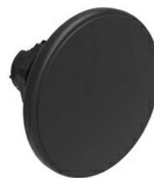
Mushroom head pushbutton, spring return Ø 60mm/2.36" LPCB616