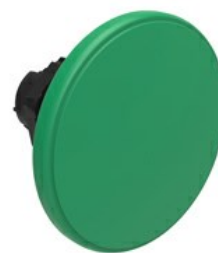
Mushroom head pushbutton, spring return Ø 60mm/2.36" LPCB616