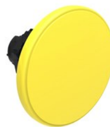
Mushroom head pushbutton, spring return Ø 60mm/2.36" LPCB616