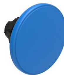
Mushroom head pushbutton, spring return Ø 60mm/2.36" LPCB616