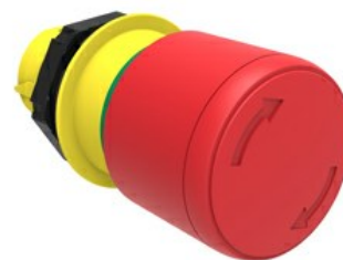
Mushroom head pushbutton, Latch, turn to release Ø 30mm/1.2" LPCB663