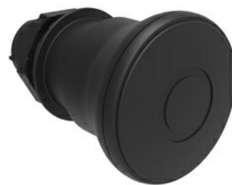
Mushroom head pushbutton, Latch, pull to release Ø 40mm/1.6" LPCB674