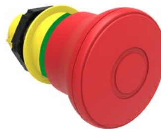
Mushroom head pushbutton, Latch, pull to release Ø 40mm/1.6" LPCB674