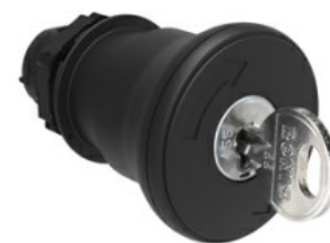
Mushroom head pushbutton, Latch, turn key to release Ø 40mm/1.6" LPCB684