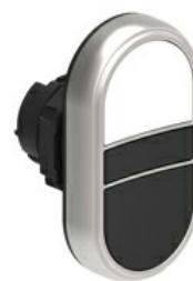
Double-touch actuators, spring return - two flush pushbuttons LPCB71