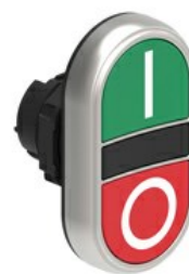
Double-touch actuators, spring return - two flush pushbuttons LPCB71