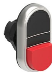
Double-touch actuators, spring return - One extended and one flush pushbuttons LPCB72