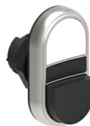
Double-touch actuators, spring return - One extended and one flush pushbuttons LPCB72