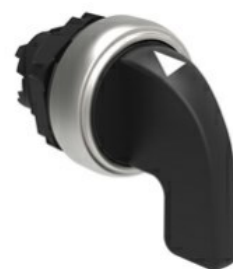
Selector switch actuators long lever - 3 position LPCS23