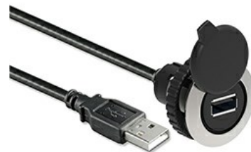
USB interface, A/A female type connection with 1m long cable LPFD0