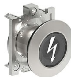
Pilot light head LPFL