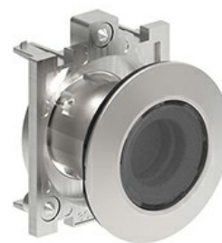
Pilot light head LPFL