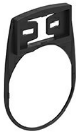
Label holder LPFXAU100

Product designation Product type designation