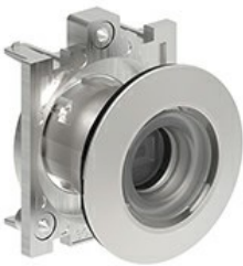
Illuminated actuator without cap LPFXQL0