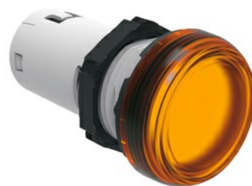
LED integrated monoblock pilot lights steady light LPM