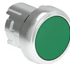
Pushbutton actuator, spring return LPSB10