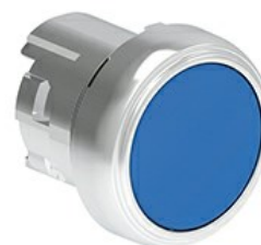
Pushbutton actuator, spring return LPSB10