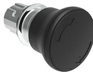
Mushroom head pushbutton, Latch, turn to release Ø 40mm/1.6" LPSB664