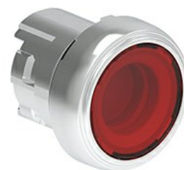
Illuminated button actuators, spring return - Flush LPSBL10