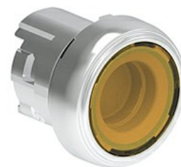
Illuminated button actuators, spring return - Flush LPSBL10