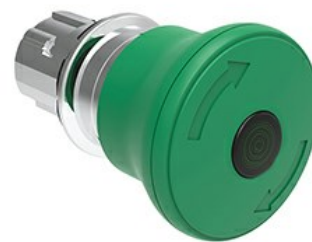
Illuminated mushroom head button actuators - Latch, turn to release Ø 40mm/1.6" LPSBL66