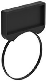
Label holder for engraved plastic LPX AU109 label LPXAU100