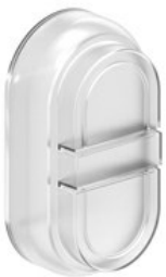
Rubber boot for double and triple- touch buttons, transparent LPXAU157