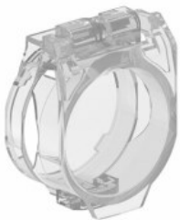
Protection cover for Ø22mm/ 5 0.015 0.87" push- buttons LPXAU170