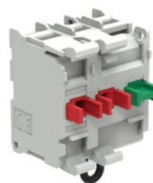
Contact elements - without mounting adapter LPXC