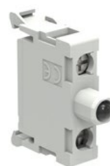
LED elements steady light base mount on LPZ control station LPXLPB