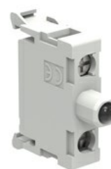
LED elements steady light base mount on LPZ control station LPXLPB