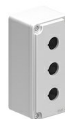
Enclosures with cut-outs for Ø22mm units - with hole for 3 actuators LPZM