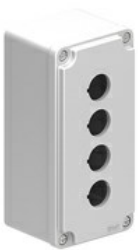
Enclosures with cut-outs for Ø22mm units - with hole for 4 actuators LPZM