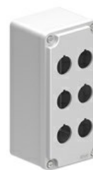
Enclosures with cut-outs for Ø22mm units - with multiholes for 6 actuators LPZM