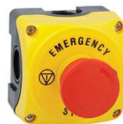
Yellow control station LPZP1A5 complete with mushroom pushbutton turn-to-release LPCB6644 1NC and "emergency/stop" disk LPZP1B5600