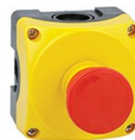
Yellow control station LPZP1A5 complete with mushroom pushbutton turn-to-release LPCB6644 2NC LPZP1B5601