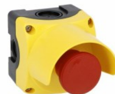
Yellow control station with shroud LPZP1A5P complete with mushroom pushbutton turn- to-release LPCB6644 1NC LPZP1B5P603