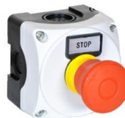
Plastic control station with one actuators - Grey, 1 way LPZP1A8 LPZP1B801