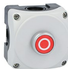
Grey control station LPZP1A8 complete with red flush pushbutton "O" LPCB1104 1NC LPZP1B8102