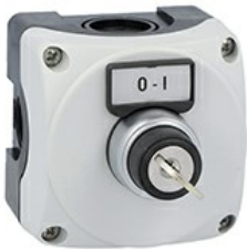
Grey control station LPZP1A8 complete with key selector lpcs320 1NO+1NC and label holder with label "o-i" LPZP1B8302