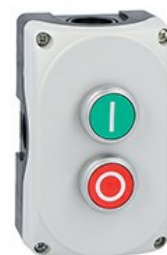
Grey control station LPZP2A8 complete with green flush pushbutton "I" LPCB1113 1NO and red flush pushbutton "O" LPCB1104 1NC LPZP2B8900