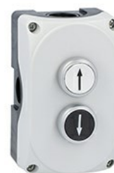
Grey control station LPZP2A8 complete with white flush pushbutton "up arrow" LPCB1158 1NO and black flush pushbutton "down arrow" LPCB1152 1NO LPZP2B8902